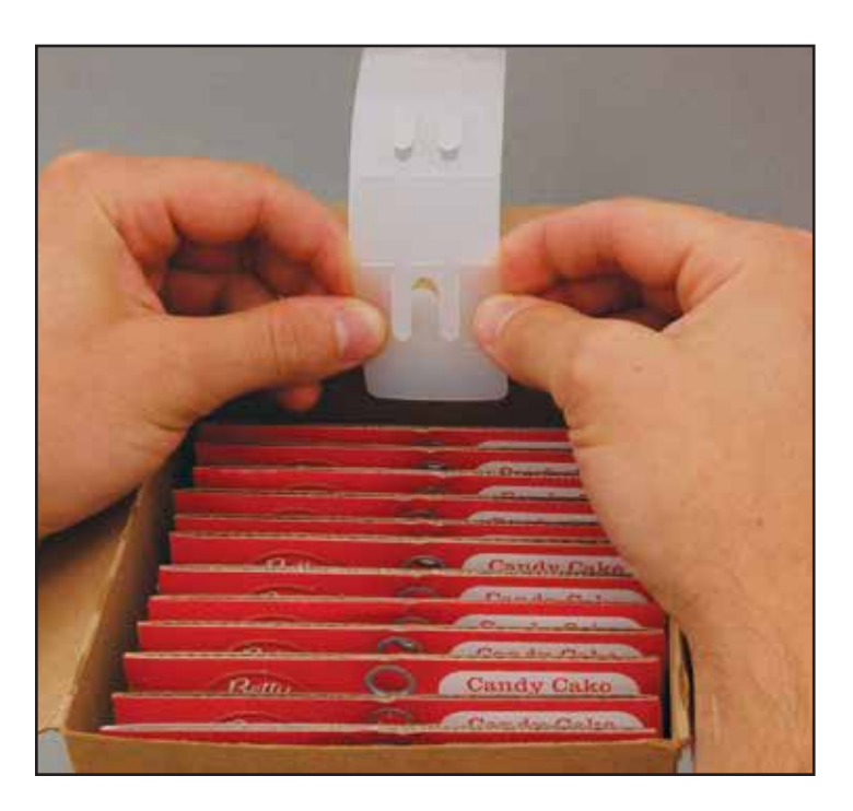
LOAD product into box. Product should be facing you. Bend strip to expose tabs.