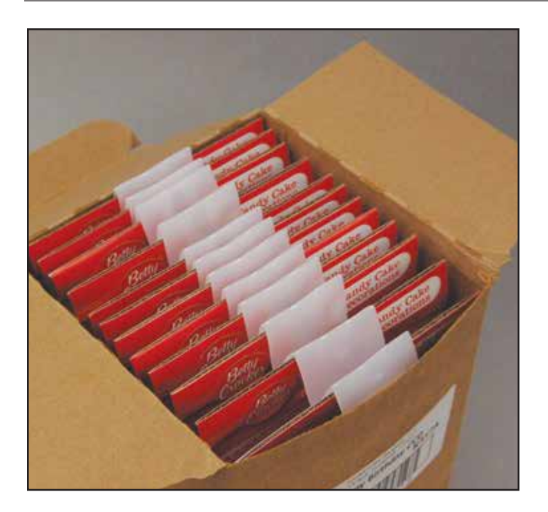
(3) Repeat procedure until complete. Close box and ship.