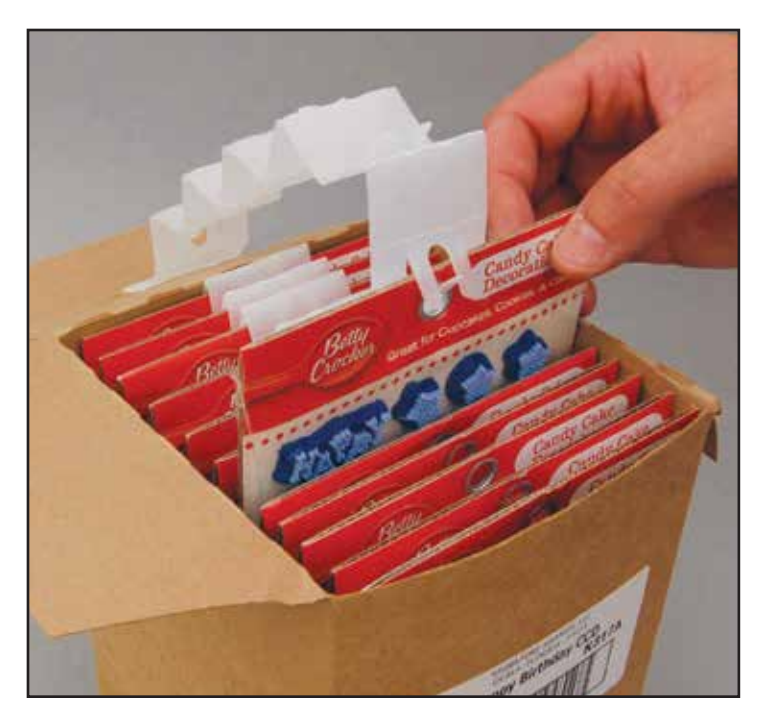
2 Start with the last package in the box and the bottom tab on the strip. Insert tab through hang hole of package. Lock tab in place. FOLD strip forward in front of package. Fold strip up at perforation to expose next tab.